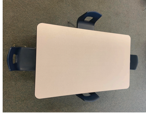
New CCS Seating example (Younger Grades)

Our goal will be to provide social distancing with minimal impact to the overall program, as long as much needed social interaction is not eliminated or negatively affected. For example, room set up in weekly chapels can be easily modified to allow more space between each student with no negative impact on the event being held. Also, seats can be made available on the bus for most trips ensuring that shoulder to shoulder contact does not need to occur.