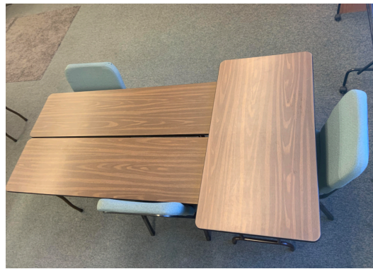
New CCS Seating example (Older Grades)