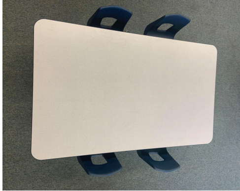
Previous CCS Seating example (Younger Grades)