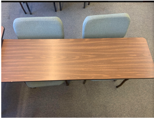
Previous CCS Seating example (Older Grades)